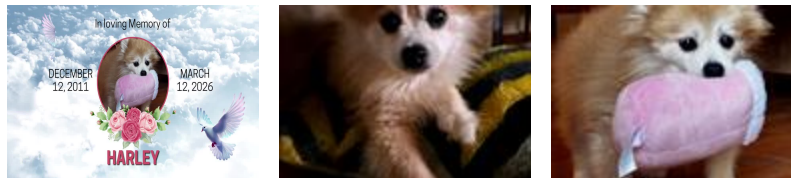
Elysian Pet Memorial - March 13 at 12:10 AM

“ 3 files added to the album Memories Album